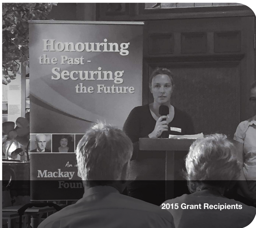
2015 Grant Recipients