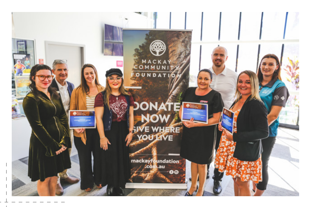
Representatives of the 2024 grant recipients.

In 2023/2024, the Foundation awarded $141,040 to a diverse range of community services, including healthcare, support for people with disabilities, community development, women's services, people experiencing homelessness and youth support.