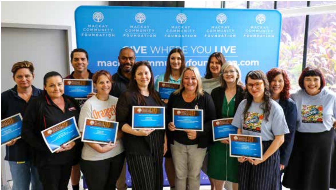
Representatives of the 2025 grant recipients.

In 2024-25, the Foundation awarded $199,902 to a diverse range of community services, including healthcare, support for people with disabilities, community development, women's services, people experiencing homelessness and youth support.