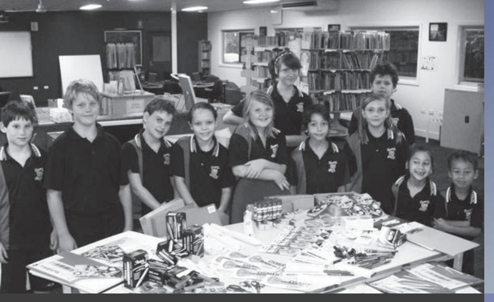
Students from Dundula State School with schools supplies purchased through the Mackay Foundation Back to School Program.

Many families were very happy with the "helping hand" from The Mackay Foundation.