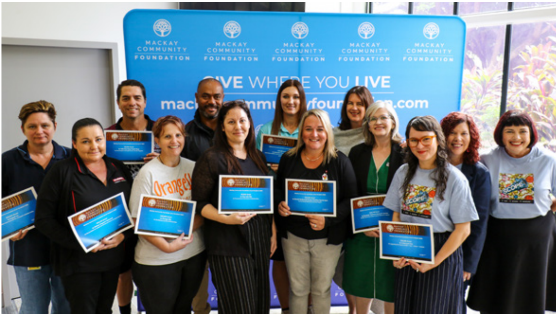
Representatives of the 2025 grant recipients.

In 2024-25, the Foundation awarded $199,902 to a diverse range of community services, including healthcare, support for people with disabilities, community development, women's services, people experiencing homelessness and youth support.